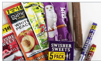
Cigars & Cigarillos