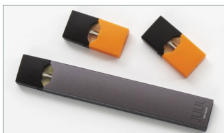
JUUL & Other Vapes

An electronic device that delivers nicotine or other vaporized liquids to the person inhaling from the device, including, but not limited to, an electronic cigarette, cigar, pipe, or hookah.