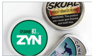
Chew, ZYN, Snus